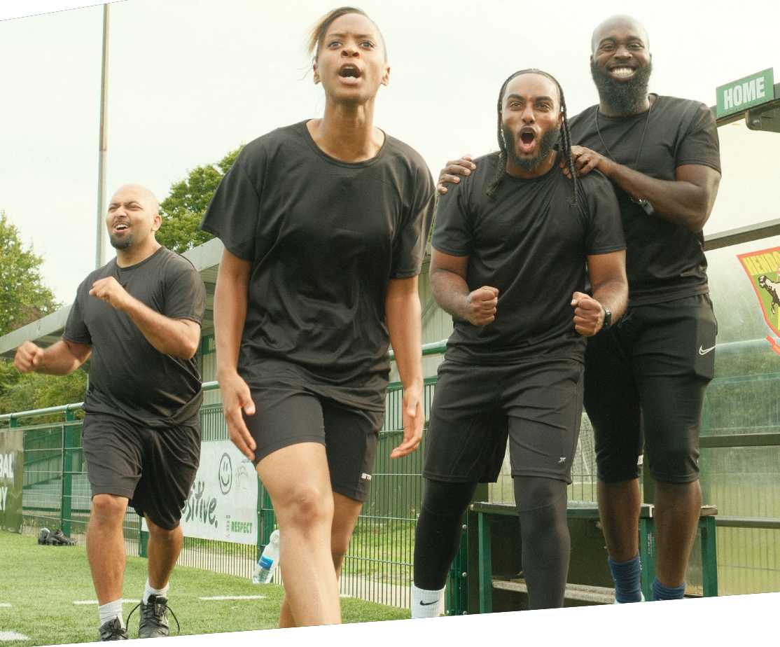
National Windrush Day